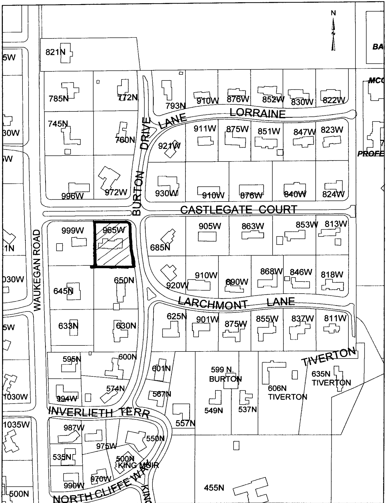
965 Castlegate Court - Deerpath Hill Estates Lake Forest, Lake County, Illinois