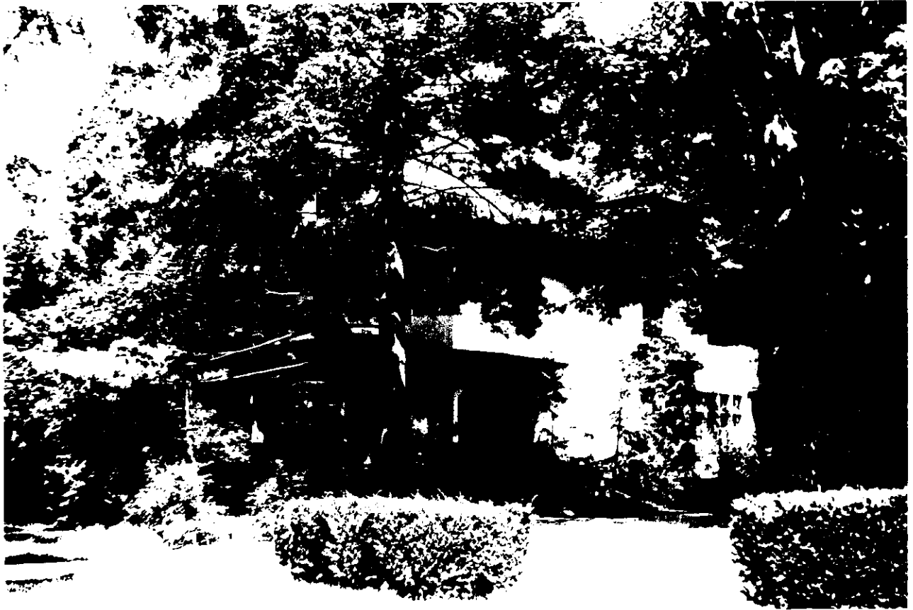
THE HOUSE AT 1234 MAIN ST. DURHAM, N.C.