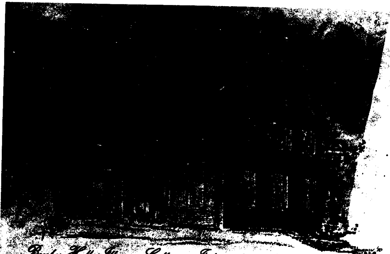
Recher Hall, Illinois College, Jacksonville 1829-30