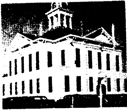
Old Court House

Eighty-three years ago Williamson County had a new courthouse. Today they have another new courthouse. The old courthouse 83 years ago was really something for that day but times have changed and so have buildings. The Williamson County new courthouse is as much more improved and up-to-date as the old one was 83 years ago over the old log cabin.